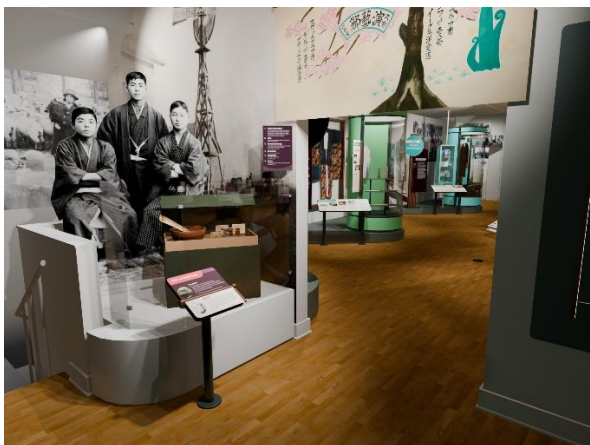
Design Elements and a sneak preview of main gallery

The final design of the exhibits is underway, and we have included here a preview of the designs by our exhibits' developer Upland Design. It's hard to visualize the final product; the detail, planning, writing and decisions on artifacts have been underway for many months. We are thrilled to see the products and fabrication of the first pedestals that will support the acrylic display cases that protect and display the artifacts. The exhibit team has seen a sneak preview of some of the finished pieces, and installation is slated to begin in March. Most aspects of the building itself have been completed, though we have additional sidewalks to install and additional grading issues to complete. We are close to our goal of preserving the Japanese immigrant story of Nebraska and the High Plains.