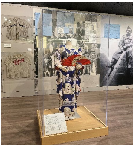
Kimono is one of many items donated to the project