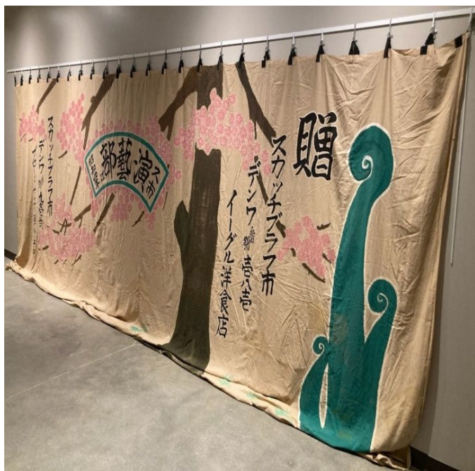
Theatre Curtains on Display at the Kearney Museum until mid-February.