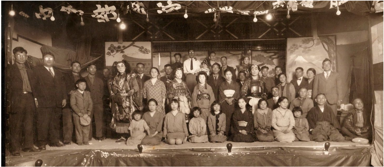
Kabuki Theater at Japanese Hall – CIRCA 1930

PROJECT: A Japanese Hall built in 1928 by members of the Japanese community and continued to function as a Japanese Hall until 2018 has been relocated to the Legacy of the Plains Museum (LPM) in Gering, NE. Here, the history of the Japanese and Japanese Americans from Nebraska and the High Plains will be preserved.