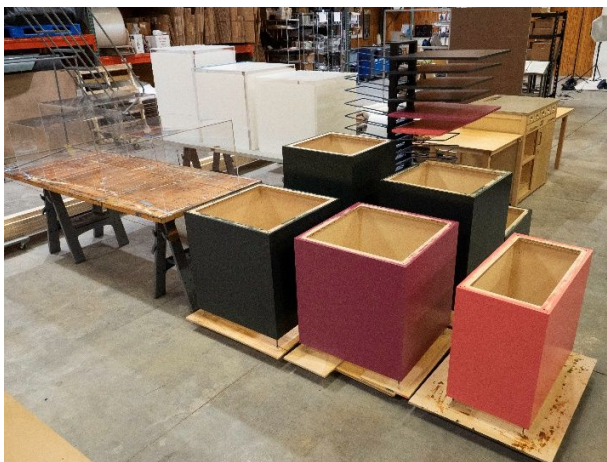
Exhibit Display Items Under Construction