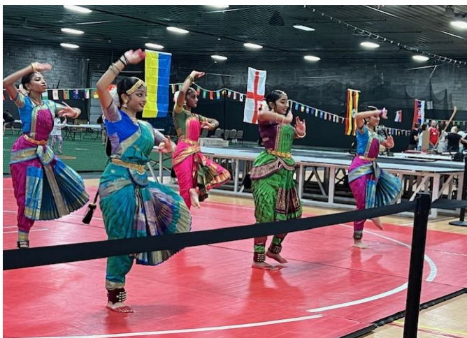
The North Platte International Festival featured Indian Arts Dancers.

We were excited to participate in the International Bazaar in North Platte, Nebraska, on August 19, 2023, and Japanese Ambience Festival at Lauritzen Gardens in Omaha, Nebraska, October 7 th , and 8 th , 2023. Opportunities to share the Japanese Immigration History of Nebraska are enlightening for both visitors and exhibitors. Activities included Kendo, martial arts, dancing, origami, and ikebana. For more information on the Japanese Ambience Festival check their website at www.lauritzengardens.org . The 2024 Japanese Ambience Festival is scheduled for October 5 th and 6 th .